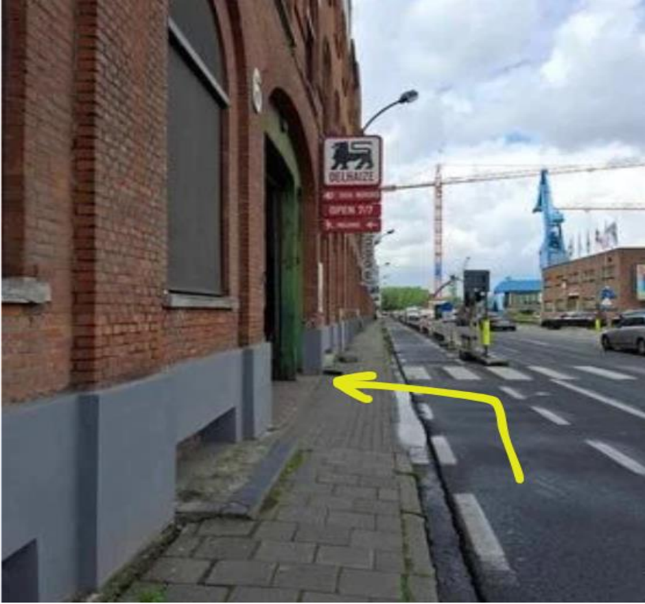
The entrance to the Dok Noord site. ATTENTION: The passage is for pedestrians and cyclists only. Parking is possible along the main road opposite this entrance or paid parking in the underground car park (see image below)