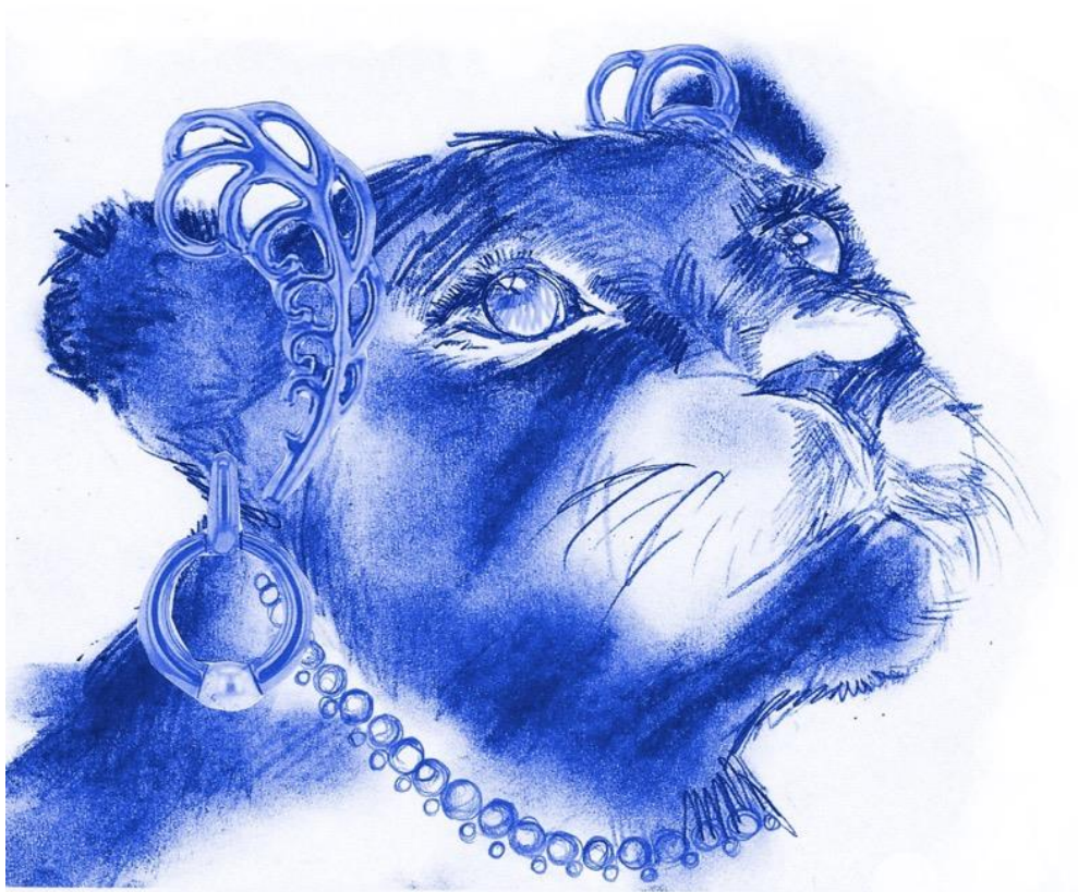
Drawings: Aline Breucker

You can and may do whatever you need to feel good.