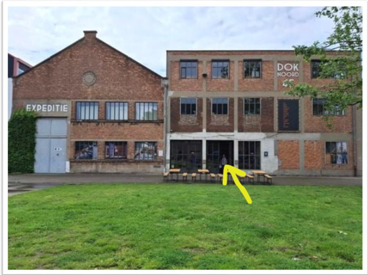
Entrance De Expeditie